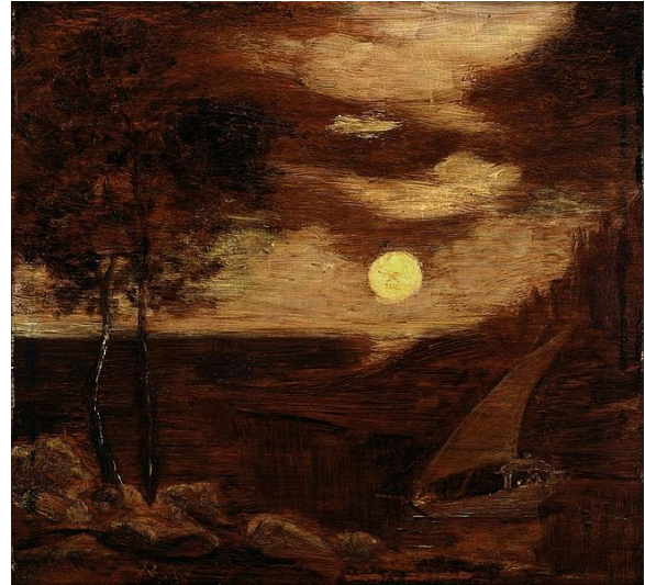
"The Lover's Boat" Albert Pinkham Ryder ca. 1881

taking each one through the full range of intensity from bright to dull.