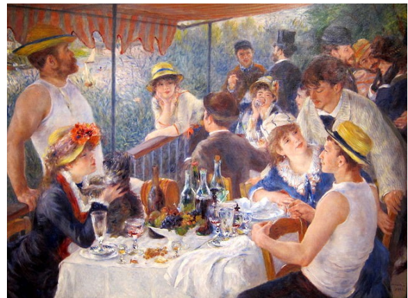
Painting by Renoir with strong value contrasts achieved by juxtaposing blue against white and yellow

A measure of skill is required to maintain balance between three colors with such variation in hue value and maximum chroma. One strategy is to reduce overall contrast, to help place the primaries in a more similar light/dark range. Alternately, for a high contrast composition, directly juxtapose blues, reds and yellows against each other or against whites and blacks.