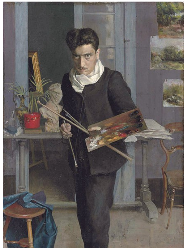
Self portrait by Julio Romero de Torres, using mid-value neutrals to reduce value contrast and emphasize intensity of color